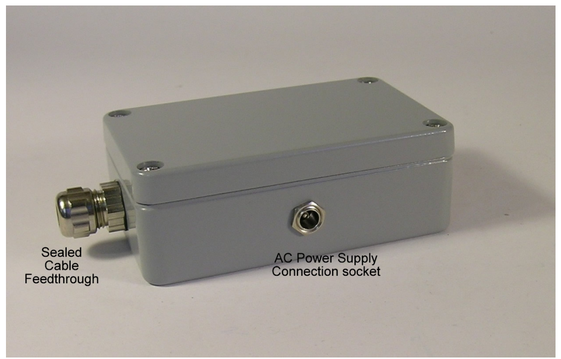
This is a photo of the connectivity box which shows the sealed, cable gland where the AR200's cable feeds through into a wire termination block. Also displayed is the connection socket for the AC power supply.